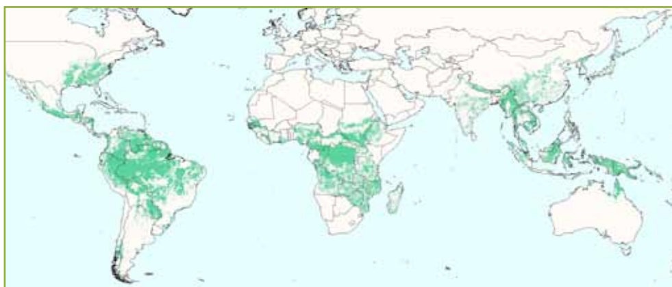
Potential distribution of bamboo within existing forest cover.